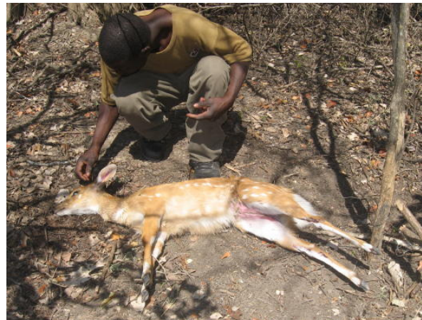
Sub adult female Bush buck snared around the waste

We went out further away from our base than last year. We went up north to the 'Shangani River', west to the Dete area, east up to the Ngamo Forest and down south to Hwange National Park.